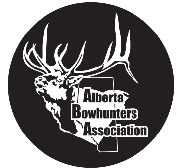
Photo of Bowhunter with Big Game animal entries are requested but not mandatory

Signature & Phone # of Witness (Verification of Bow Kill) _____