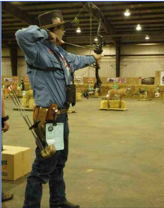
Hip quiver, scoring sheets and binoculars are essential 3D gear.

The months between fall hunting seasons is a long time to go without shooting your bow. Participating in 3D off-season indoor archery competitions forces bowhunters to practice, retain memory muscle and form or simply offers a welcomed change from range paper targets. Getting together with old friends and meeting new similar passionate bowhunters is lots of fun and can help kick the winter blues - plus there's no work needed after hitting the mark. 3D shoots offer bowhunters of any age or gender the chance to compete by shooting various life size animal foam targets over different unknown distances.