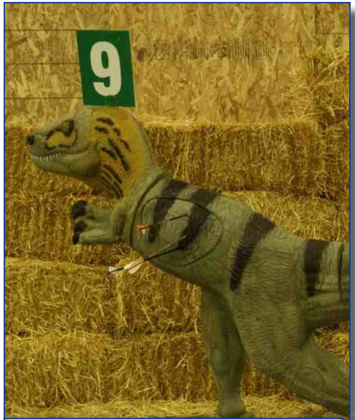
3D shoots offer the bowhunter a chance to shoot life-size targets of animals they will never see in the field. Fun for all ages.

TIMING TIP: 3-4 minutes is plenty of time for your entire group to shoot. To not waste time, don't glass targets while at the shooting line – aim and shoot only. Step back to glass and let others shoot while you study your next target. Don't rush your shots –it's common that the shooting line marshal stops the clock early if all groups have finished their station.