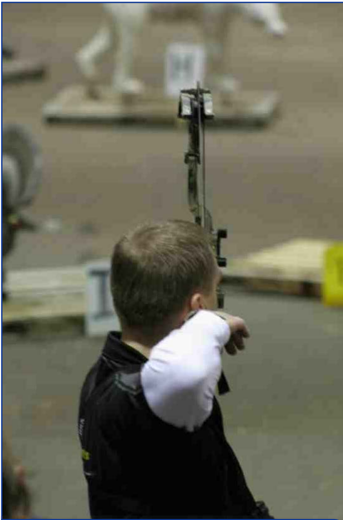
Indoor 3D shoots over the winter months are a great fun way to stay in shooting shape.

spot, 10 points for next largest circle (heart/lung shot), 8 points for any arrow embedded in the vitals region, 5 points if the target is hit at all (wound) and finally, 0 points for clean misses. Many of the shoots offer additional fun rounds involving arrow wrecking steel plates (if you miss), moving targets and 1 inch bulleye attempts from distances approaching 100 yards – big prize for hitting that mark!